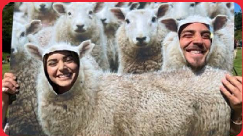
LAMB BBQ. WE CREATED SOME PROPS FOR THE PHOTO BOOTH AS A FUNDRAISER FOR THE AGM PRESENTATION