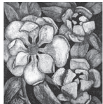
Hawk and Rose Press

Discover the diverse and excellent artistry on Mayne Island and enjoy a chance to peek inside the studios of resident artists and artisans.